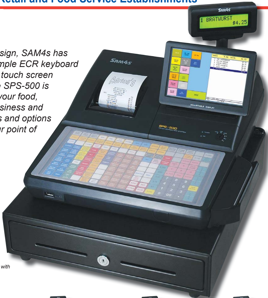
SPS-500 Series Hybrid ECRs Shown with Optional Card Reader

Featuring a hybrid design, SAM4s has combined fast and simple ECR keyboard entry with an intuitive touch screen operator display. The SPS-500 is easily configured for your food, beverage, or retail business and provides the functions and options you need to meet your point of service needs.