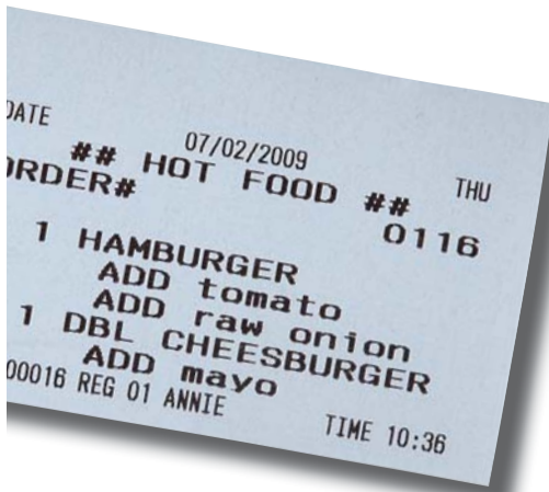
Kitchen requisition printed by the SPS-530 80mm receipt printer shown 75% actual size.